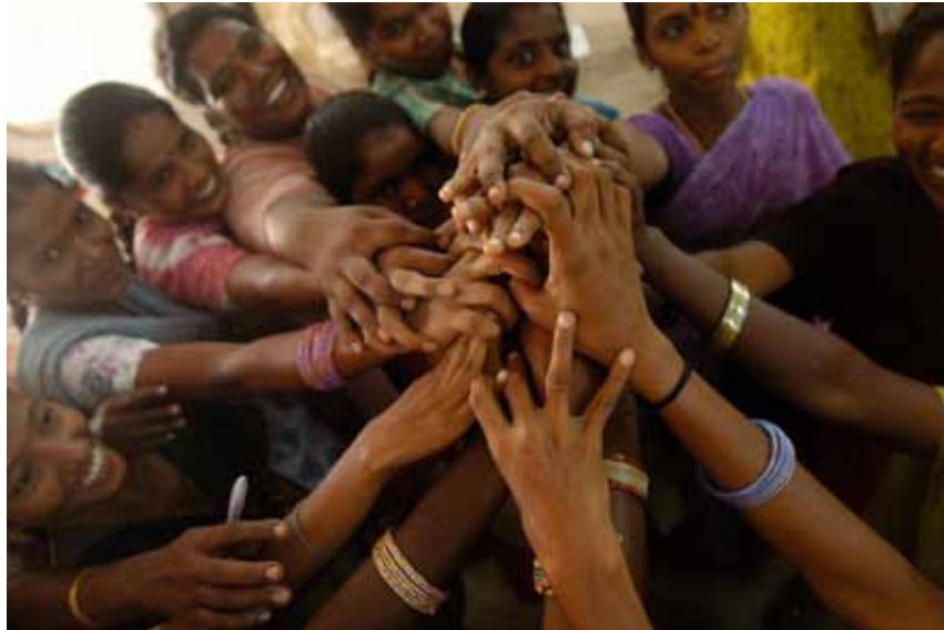
The peace concert was "impressive."

The PCI programme, supported by the WCRC Partnership Fund, aims to break this vicious cycle. It will give concerts to promote peace