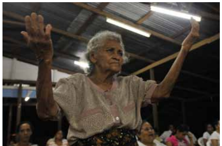
“As we gather for worship we open ourselves to God”

Wise is the worshiping community that recognizes how the Holy Spirit