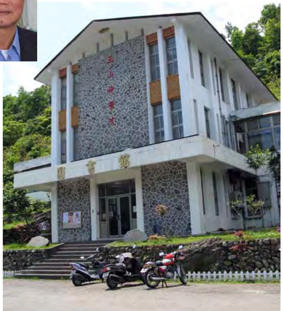
Yu-Shan Seminary in Taiwan offers programme for Indigenous students