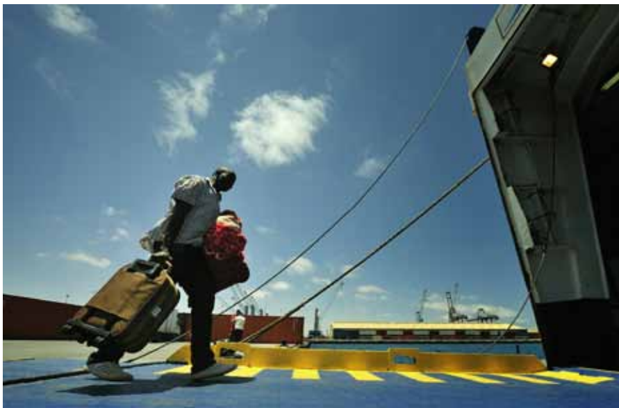
Foreign workers have fled Libyan turmoil.

The Uniting Church, a member of the World Communion of Reformed Churches, wrote to all Federal Labour parliamentarians expressing its shock over the "cruel and punitive" plan and urged compassion.