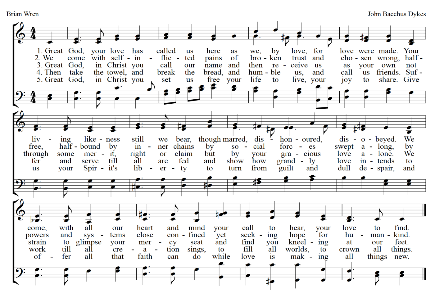
English © 1977 Hope Publishing Company, Carol Stream, IL, USA.